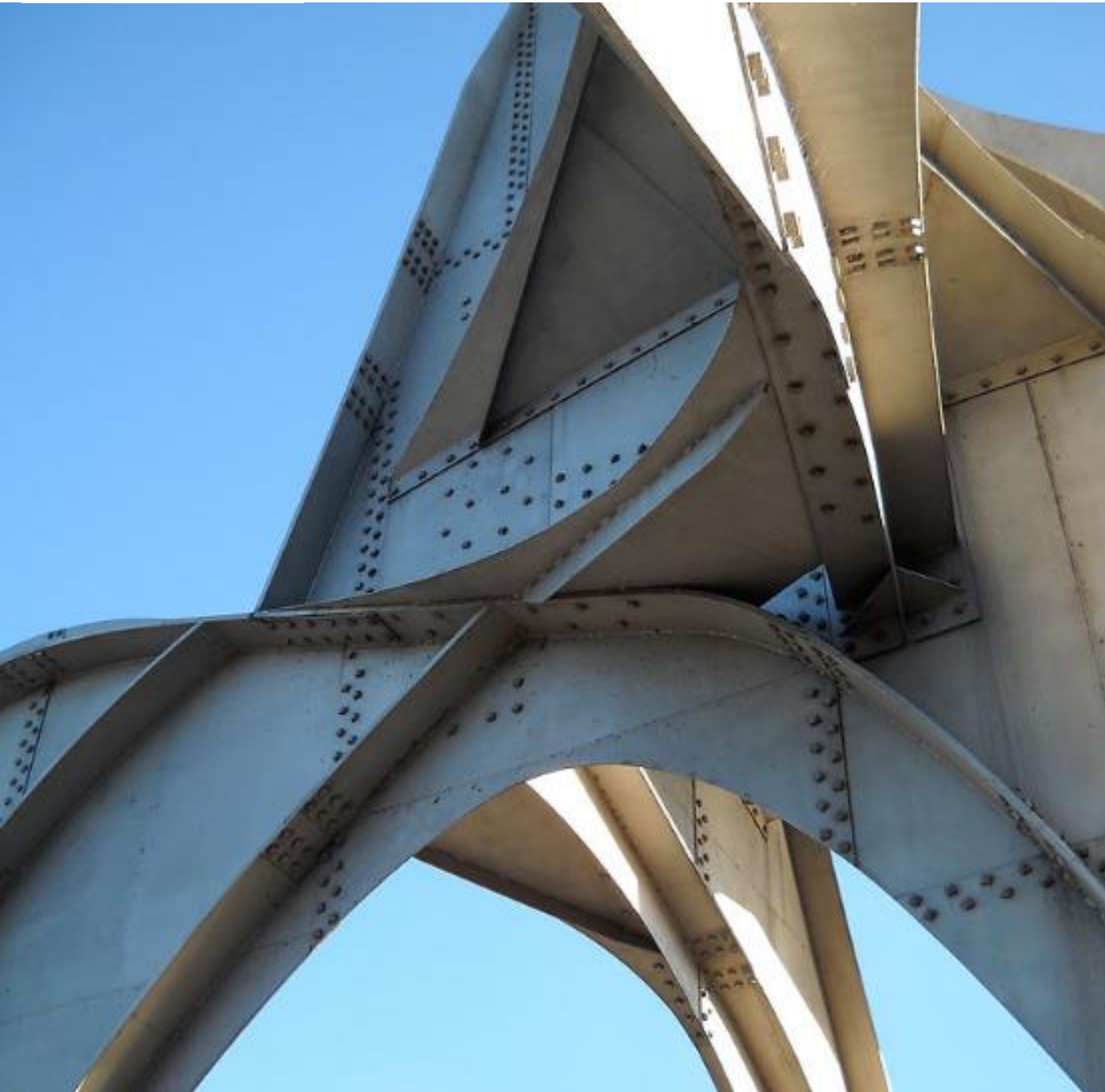
L'homme , Alexander Calder (1967, outdoor sculpture in Montreal)

Scan here with your mobile device to get future updates.