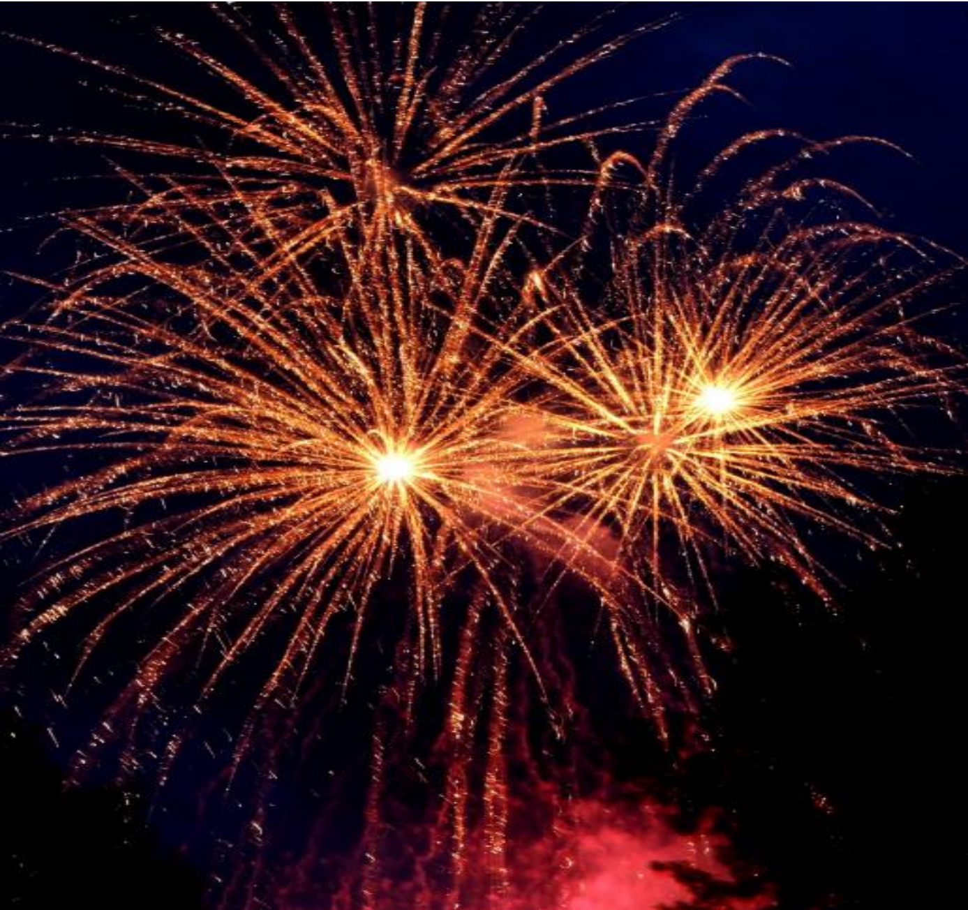
Fireworks during nighttime

Scan here with your mobile device to get future updates.